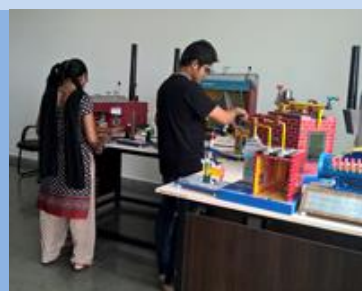
Library Facilities :