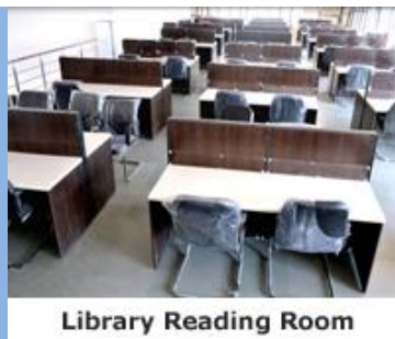
Library Reading Room